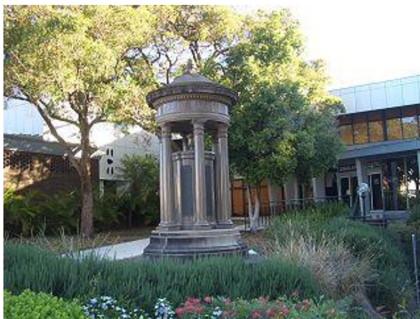
Drummoyne War Memorial